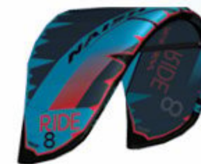
RIDE SIZES: 4 | 5 | 6 | 7 | 8 | 9 | 10 | 11 | 12 | 14 ALL-AROUND FREERIDE