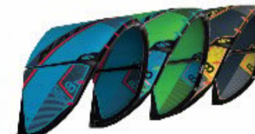
PIVOT SIZES: 5 | 6 | 7 | 8 | 9 | 10 | 11 | 12 | 14 FREERIDE/WAVE