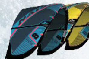
SLASH SIZES: 4 | 5 | 6 | 7 | 8 | 9 | 10 | 11 | 12 PURE WAVE/STRAPLESS