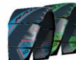
TORCH SIZES: 5 | 6 | 7 | 8 | 9 10 | 11 | 12 | 14 PRO PERFORMANCE/ FREESTYLE