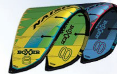
BOXER SIZES: 3.5 | 4 | 5 | 6 | 7 | 8 | 9 10 | 11 | 12 | 14 | 16 FREERIDE/FOILING

There's a world of options competing for your attention. How you choose to spend it defines your time.